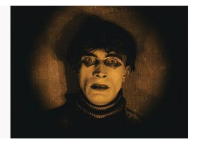
Screenshots: Friedrich Wilhelm Murnau Foundation

The right to use the image material is reserved exclusively for reporting on the exhibition Be Caligari! The Virtual Cabinet. Any use beyond this is not permitted. The right of use ends on April 20, 2020. We kindly ask you to respect all copyrights/proveniences.